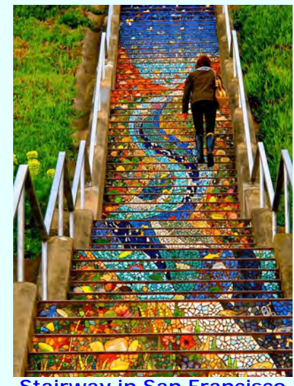
Stairway in San Francisco