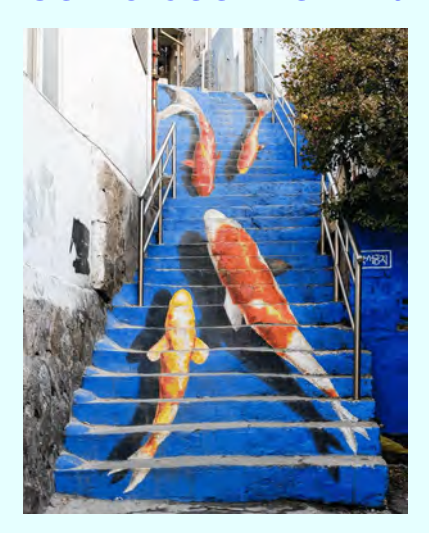
Stairway in Korea