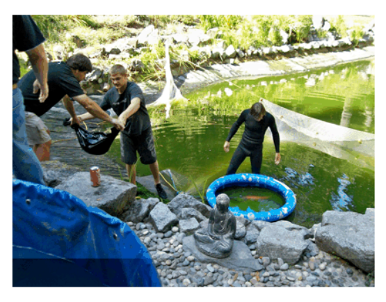
October 3, 2015

Come join us to celebrate this year's harvest of Blazo Koi. 11:00 a.m. - 6:00 p.m.