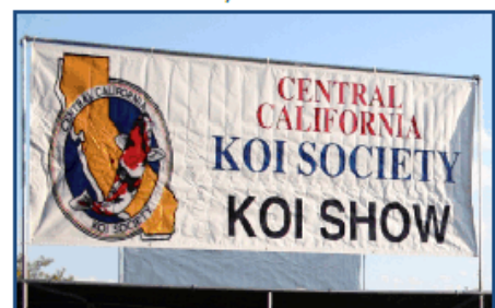
Noi competition and Judging Dond and Noi vendors Raffles and auctions

Saturday and Sunday September 26 & 27, 2015 Fig Garden Village 5082 N. Palm Ave, Palm & Shaw, Fresno, California